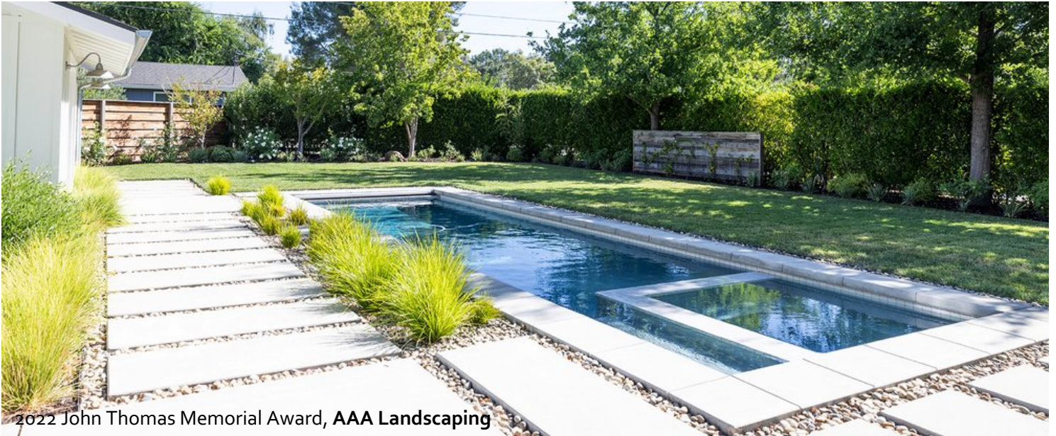
2022 John Thomas Memorial Award, AAA Landscaping