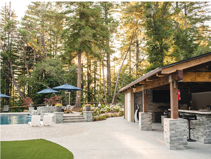
Hull Residence by K&D Landscaping Inc. winner of the Residential Estate Installation Award sponsored by Ewing Irrigation and Landscape Supply.