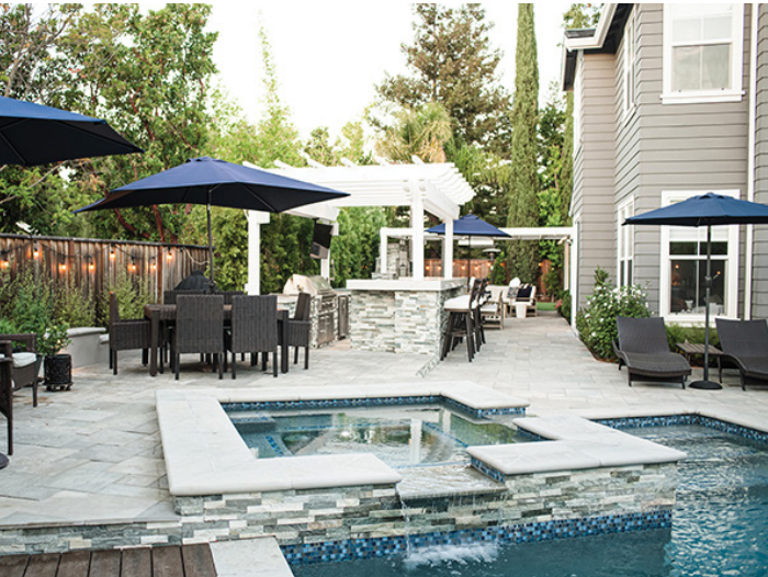
Contra Residence by K&D Landscaping Inc. winner of the Large Residential Installation Award sponsored by AG Sod Farms Inc.