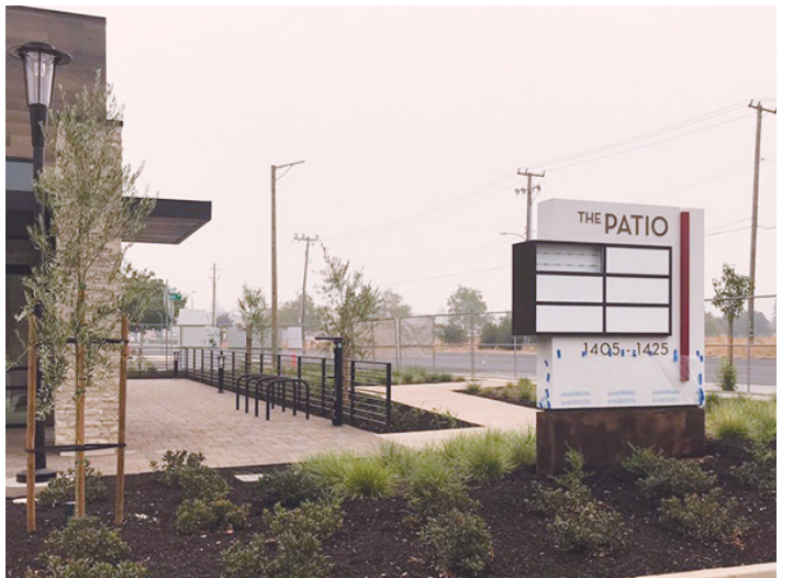
The Patio Shopping Center by K&D Landscaping Inc. winner of the Small Commercial Installation Award sponsored by Synthetic Turf Resources.