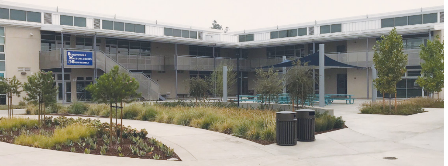
Above: Britton Middle School by K&D Landscaping Inc. winner of the Herb Frank Memorial Award, sponsored by Kellogg Garden Products, at the CLCA Trophy Awards held November 14.